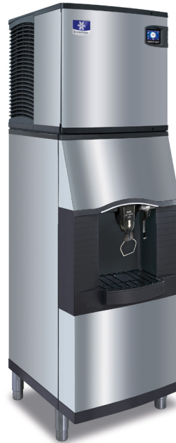
Indigo NXT iT0620 Ice Machine SFA-192 Ice & Water Dispenser (Ice Machine and Dispenser sold separately)