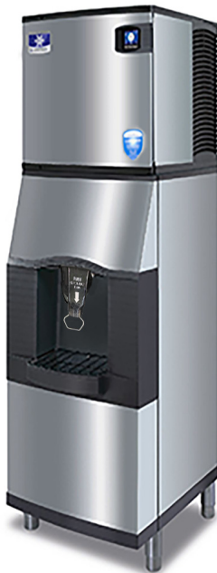
Indigo NXT iT0620 Ice Machine SPA-162 Ice Dispenser (Ice Machine and Dispenser sold separately)

Coupled with an Indigo NXT ice machine, you can program the ice machine to be off at night so that while the hotel guests are sleeping, the ice machine can be too!